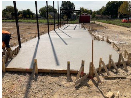
New concrete around baseball fields

You'll be watching double headers soon! Recently, the contractor excavated in preparation for the installation of ballpark equipment, adjusted storm frames, and seeded and blanketed the western pond. The contractor also installed fencing behind home plate and started painting the new storage and restroom facilities.