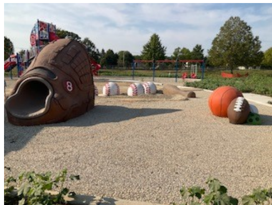
Sports themed playground