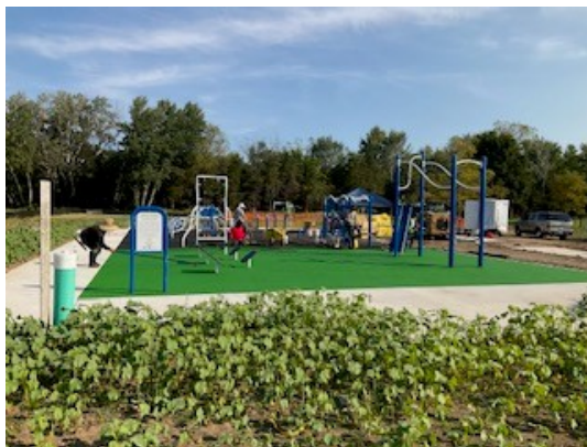
Exercise equipment installed

This week, the contractor will continue to pour concrete around the baseball diamonds and install the scoreboard, flagpoles, and foul poles.