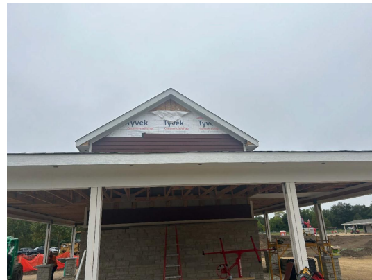
Siding for storage and restroom facilities

For more information on Algonquin's Parks scan the QR code or visit the Village Parks website: