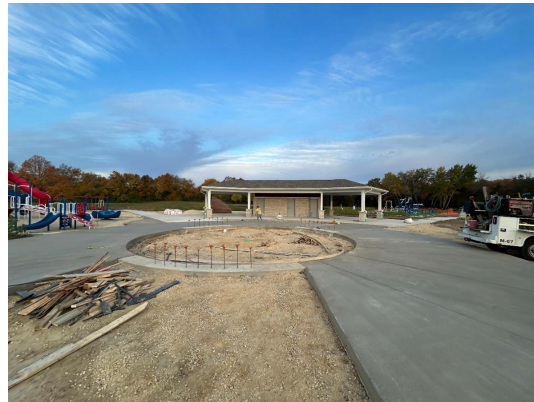
Concrete pour progress

We can't wait to share this grand slam with the community, check out the wonderful progress photos below!