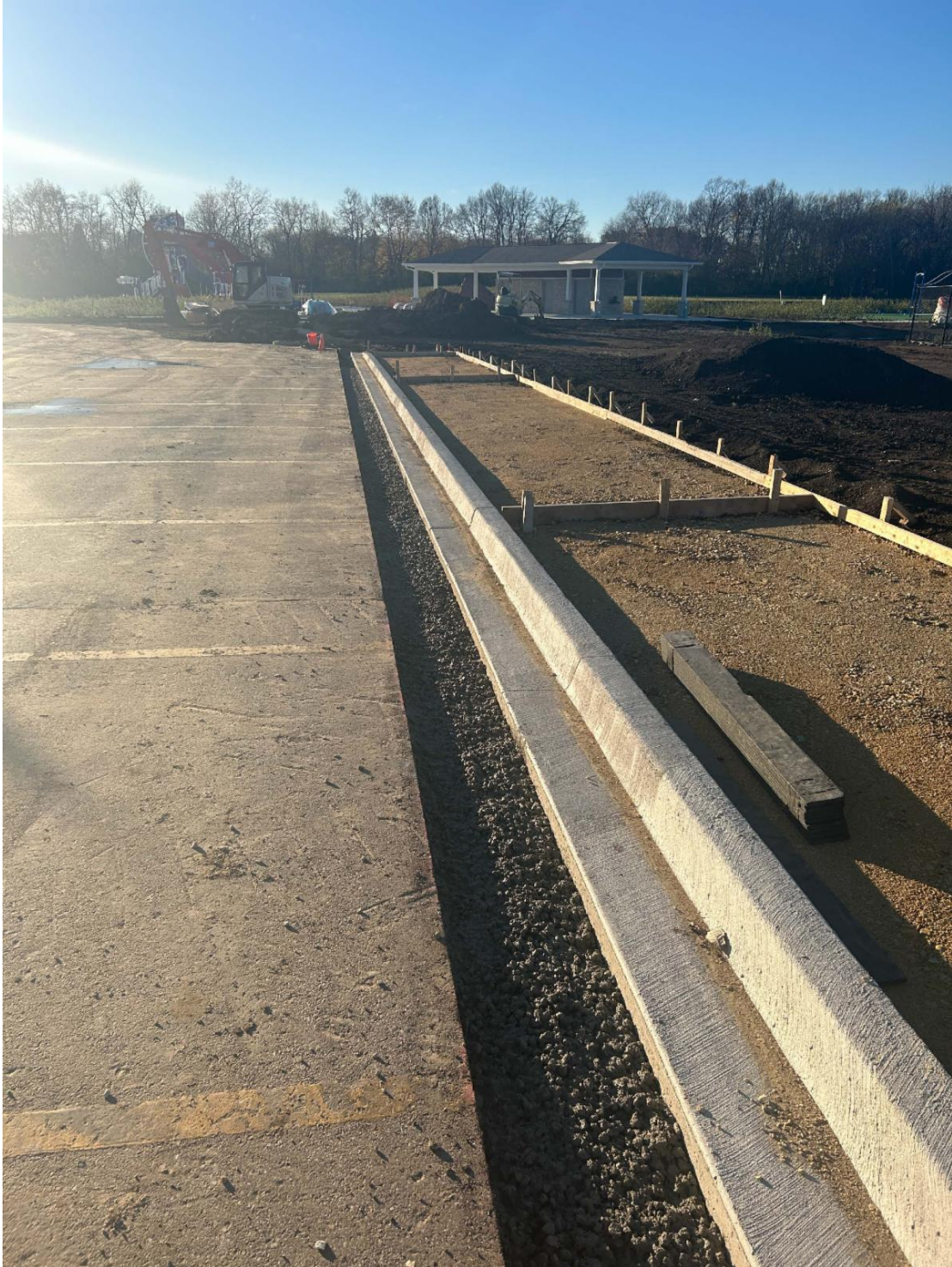
Placing concrete base

Click below to see the recent progress at Presidential Park!