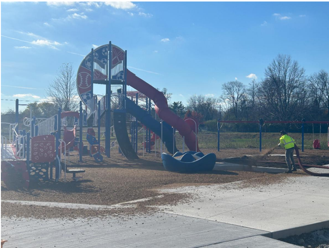
Placing and spreading mulch

We are in the final innings of the project, check out this week's progress photos!