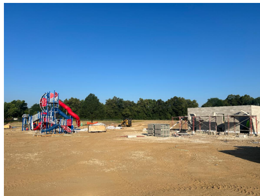
New playground equipment

For more information on Algonquin's Parks scan the QR code or visit the Village Parks website: