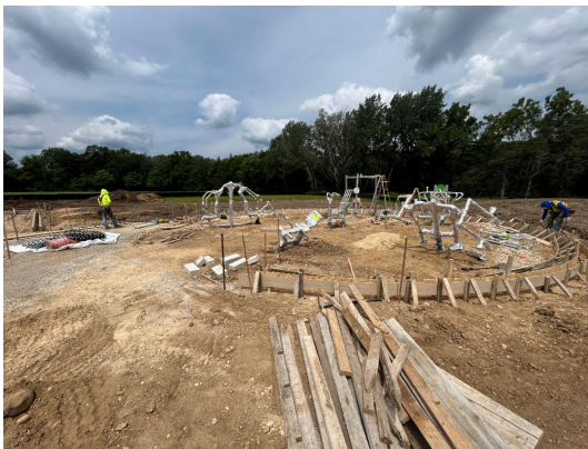
Fitness playground installation