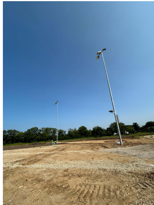
Baseball field lighting installation

Next week, the contractor will continue with concrete pours, plumbing work, and roof truss installations on the new storage and restroom facilities.