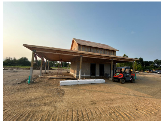
Facility roof truss installation

For more information on Algonquin's Parks scan the QR code or visit the Village Parks website: