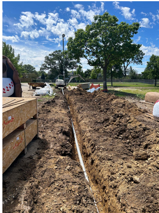
New light pole & conduit installation

Next week, the contractor will continue taking delivery of playground and baseball field equipment. Additionally, grading for the new playground curb and roof truss for new buildings will commence.