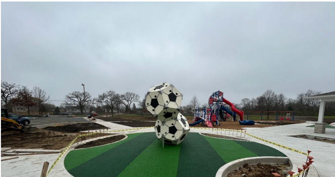
Soccer themed climbing wall

Due to the early appearance of winter weather, the final landscaping restoration around the park and asphalt surface on the parking lot will be completed first thing in the spring, just in time for baseball season!