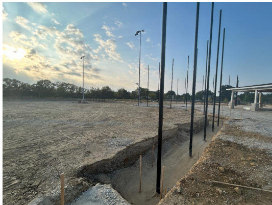
Foundation work for the baseball field posts

Next week, the contractor will install the foul poles and excavate the dugouts for the baseball fields. The contractor will also install the plumbing and water heaters at the new restroom and storage facilities.