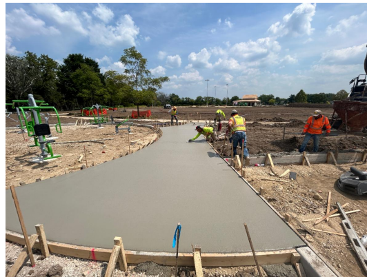
Pouring concrete for new sidewalks

For more information on Algonquin's Parks scan the QR code or visit the Village Parks website: