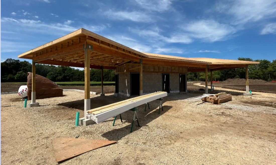
Framing for new restrooms

For more information on Algonquin's Parks scan the QR code or visit the Village Parks website: