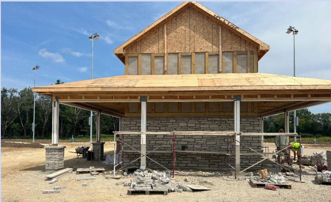
Brick veneer for the storage facility

Next week, the contractor will install the brick building exterior for the restroom facility and pour concrete for the curbs at the baseball fields, playground, and parking lots. The contractor will also install the plumbing and electrical fixtures at the new facilities.